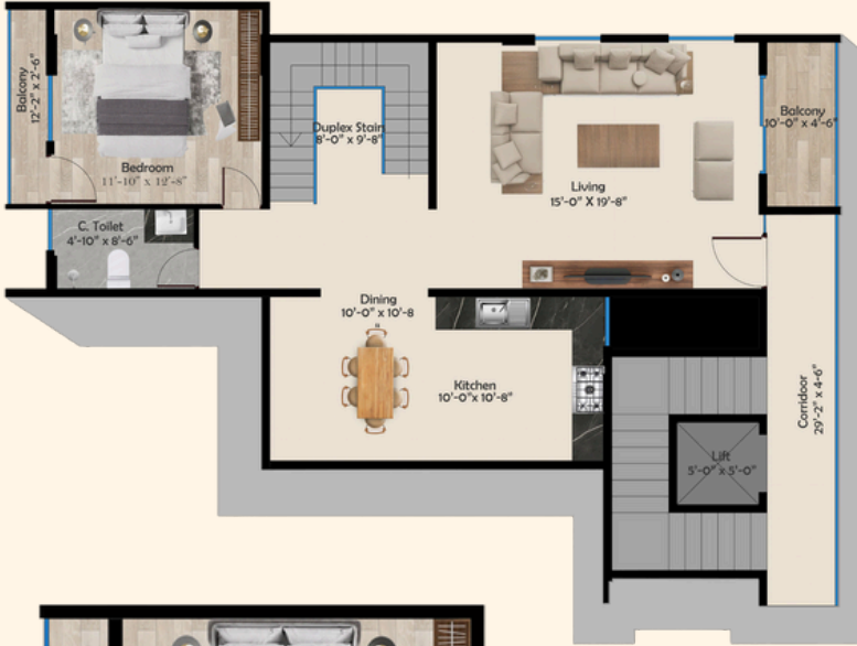
Level 1 - Top View

Unit 3 is a spacious Duplex 3 BHK with built up area of 1966 sq.ft.